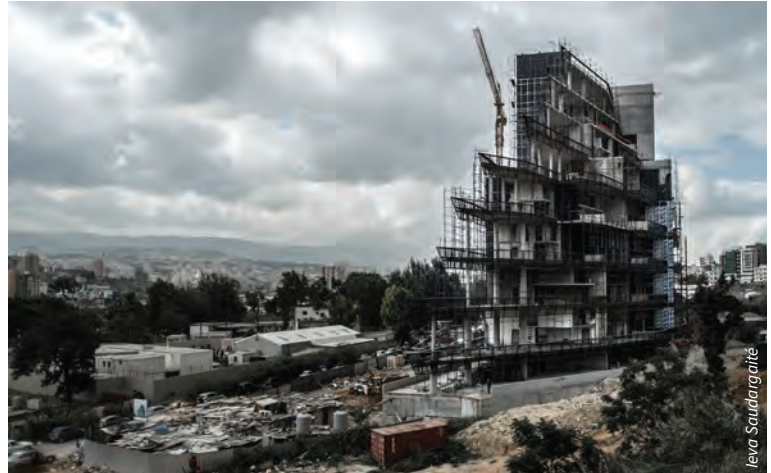
> Factory Lofts/Plot #1282|3853

“I’ve often been accused of foregoing my political resistance ... when I began to work with private developers”